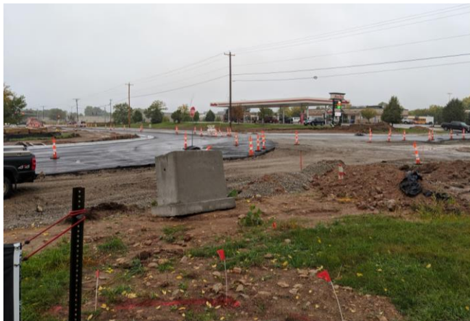
Victory Lane Roundabout

Sommers Construction constructed curb & gutter and driveways between Capitol Drive and Amberwood Lane.