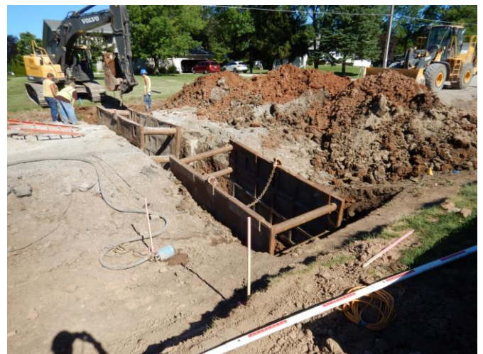
Water service installation

Relyco is scheduled to start work on the Bentwood Estates ponds.