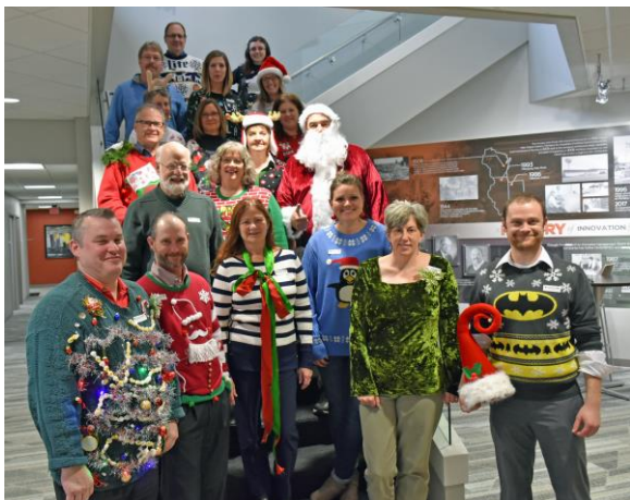
Ugly Christmas Sweater Day at McMAHON. Donations for participation for the benefit of LEAVEN.

McMAHON is proud to support programs and events that help make our communities a better and more enjoyable place to live. Recent support includes: